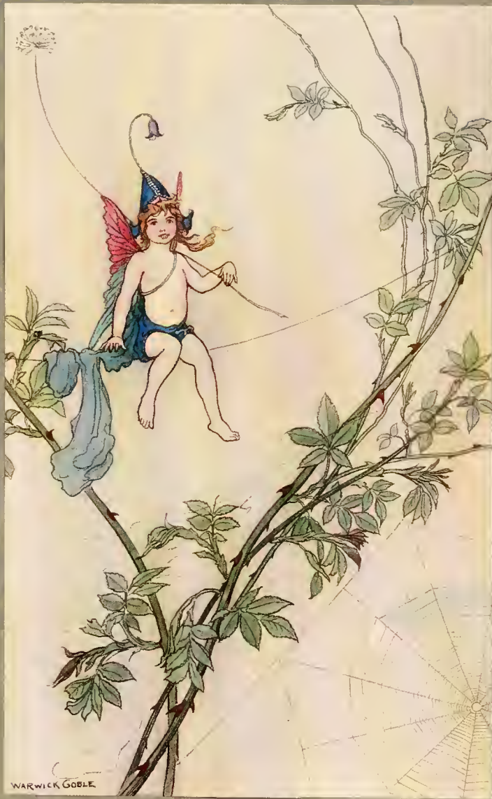
“ But Puck was seated on a spider’s thread.”